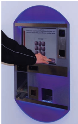
IN THE WALL OPTION